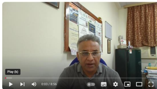
Intl Conference on Ibn Sina (16.8.2024), Tashkent, Uzbekistan

anniversary of Abu Ali Ibn Sina, organised by Ibn Sino Foundation (Tashkent, Uzbekistan).