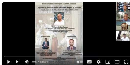
20240914 IDWDCM presents: Influence of Medieval Muslim scholars in the field of Medicine www.youtube.com/watch?v=apaabPqnIEk&t=2s